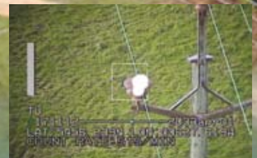
Equipped with different camera types the Corona 350 can easily detect both corona and hot-spots.

The Corona 350 is a gyro-stabilized gymbal containing three different cameras: an Ultraviolet camera for corona detection, a thermal imaging camera for detecting hot-spots in powerlines which can lead to costly breakdowns and a visual light camera. The Corona 350 is the ideal instrument for aerial power line inspections.