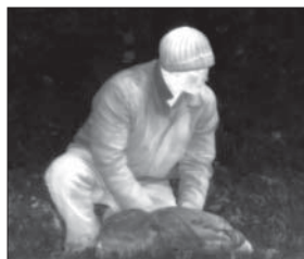
Portable high-resolution thermal imagery